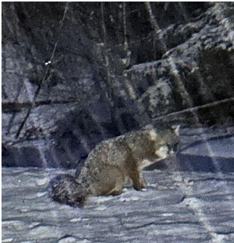
Grey Fox in an April Snowstorm

* Contacts: Laurel LaurelACopeland@gmail.com or 210-488-1701 (text/call), Andrea at UnderwoodJones154@gmail.com