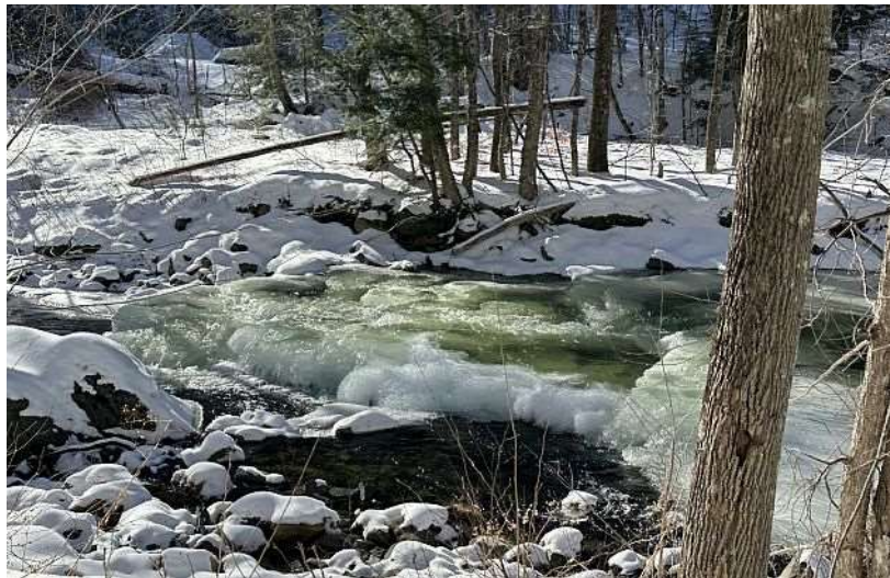
THE GREEN RIVER was looking exceptionally green one day as I drove down to Brattleboro. Like the river, the route to Brattleboro goes downhill, from 1700 feet elevation at my house to 300 feet at the Connecticut River. West Brattleboro sits at about 500 feet elevation.

Check address label for your subscription expiration date. Send $7.00 to cover postage for your mailed paper copy. Send check made out to “Newsletter” to Joan Courser P O Box 27 West Halifax VT 05358.