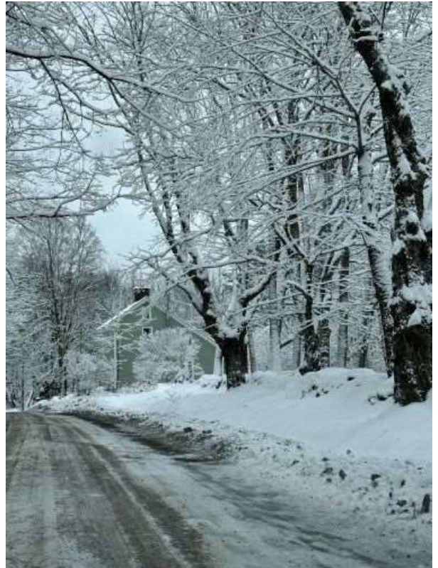
The snow made a pretty scene on Hanson Road