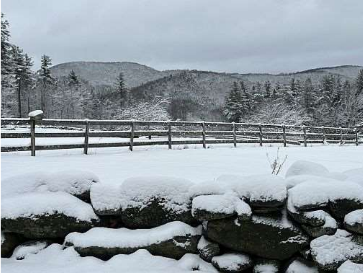
Fences and Stone Walls Above West Halifax