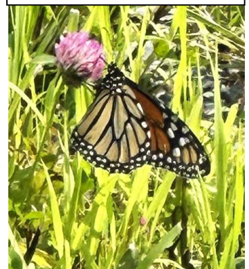
Monarch butterfly sipping from a Red Clover

Archives: https://czresearch.com/newsletter