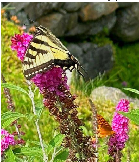
Swallowtail and small orange Fritillary on butterfly bush.

Although I first saw a Viceroy back in June, it was not until August 20 that I spotted a Monarch. Happily, I am still seeing the Viceroy's (extra bar across lower wings), and a lot of Swallowtails, Blue Admirals, and Fritillaries as well as those little guys that dance around the ground in August, adding color and humor.