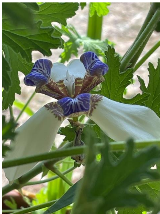
Walking Iris blooms in my indoor pot