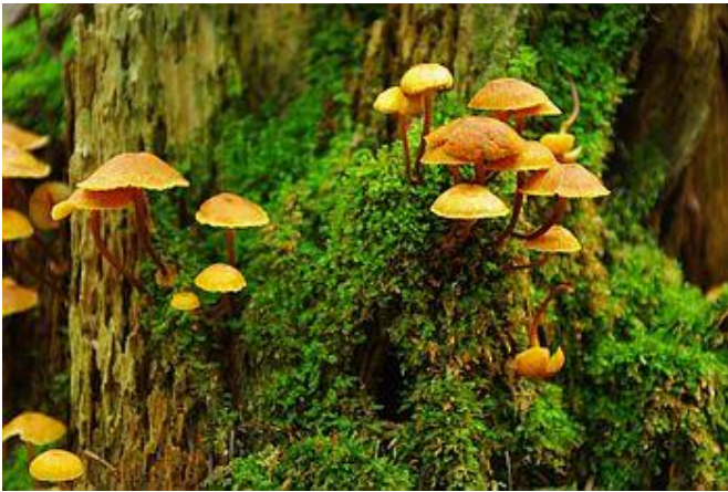
A mushroom & moss tableau ... a scarlet sentry ... a staircase of mushrooms