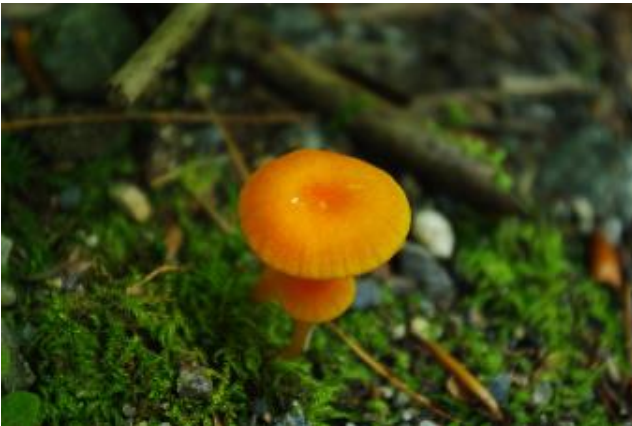
My guesses: Viscid violet cort (do not eat) & Orange moss agarica (do not eat) & Golden spindles (do not eat) - Laurel

In the woods of Halifax, you can find mushrooms of a variety of colors, forms, shapes, and growth patterns. Some are identified, some mysterious. The form may be stemmed with a cap, or shelf-like, or frilly. You are invited to browse the forest floor with these photographs.