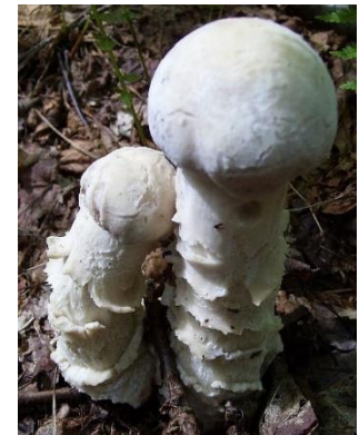
Unidentified white mushrooms with petticoats