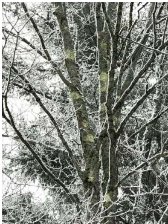
Lichen, snow and tree in April