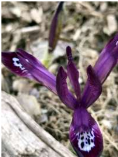
Dwarf Iris reticulata on Hanson Road