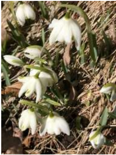
Snow drops in David's garden in Halifax Center