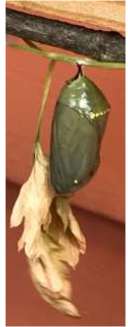
Monarch chrysalis in mid-October

Newsletter P O Box 27 West Halifax VT 05358