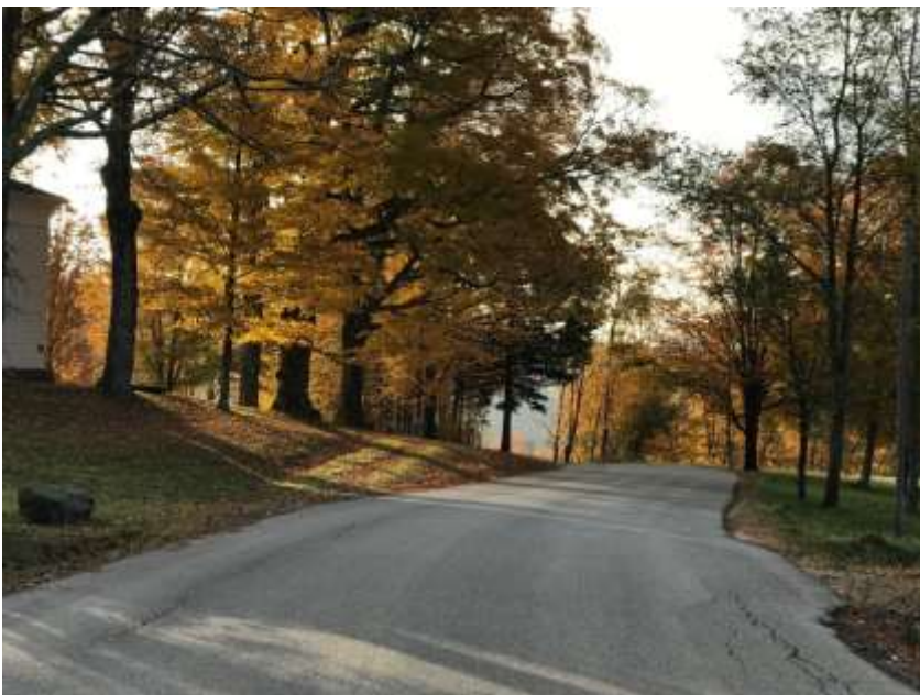
October Color on Collins Hill