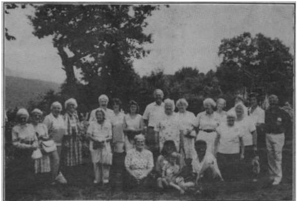
Members of the Historical Society at Hildene.