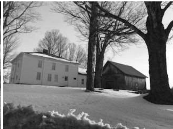
Sunrise over Halifax VT, March 27, 2018