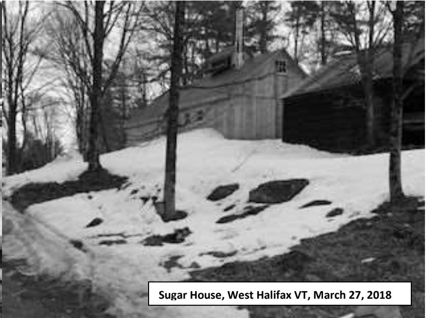
Sugar House, West Halifax VT, March 27, 2018